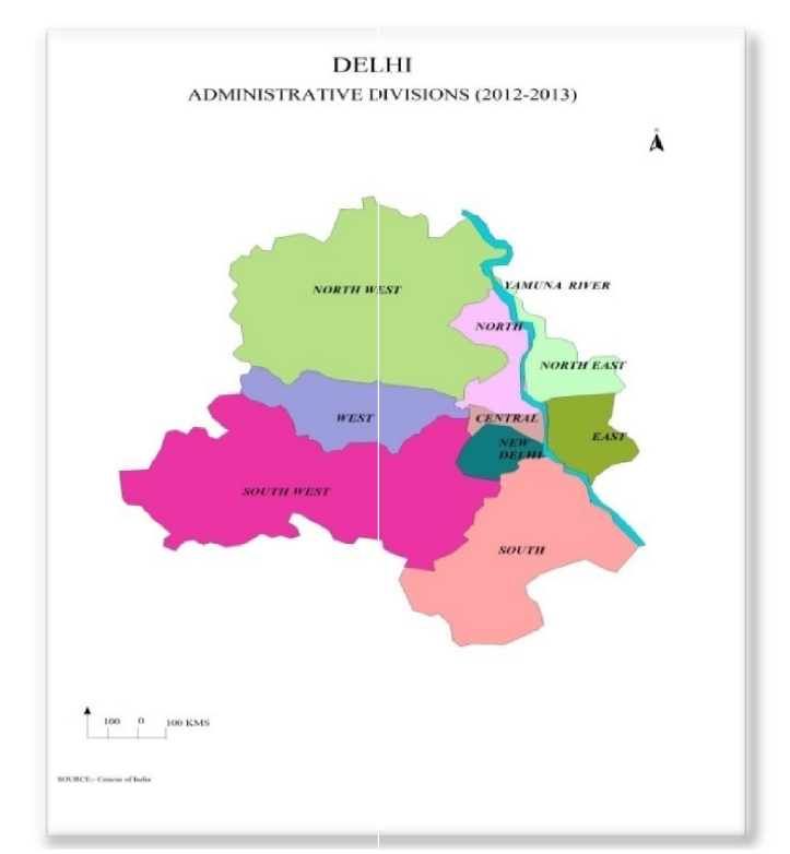
Map 1.1. Administrative Divisions of Delhi

The struggle for Delhi electoral body stared in 1962 when the formation of the Delhi Municipal Committee (DMC) failed miserably fulfilling the expectation of people. Delhi was then the head quarter of the Eastern division in British India. In 1912, Delhi was carved out as a separate province with special status showing King George's decisions to shift the capital from Calcutta to Delhi. Delhi was placed under chief commissioners having financial and administrative power under central government.