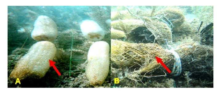
Figure 3. The used substrata fixed on the stainless steel model under water (a); Luffa egyptica and the (b) Leaf palm

These different substrates ( Luffa egyptica , Leaf palm and the artificial fibers) were fixed on stainless-steel frames with a steel network coated with insulation paints. These units, with the substrates, were then fixed in different habitats to recognize and select the best habitat for the amphipods collection as modified collectors of amphipods (Figure 3). The used frame models were prepared in a rectangular shape with dimensions of 40 X 50 cm and, were fixed for a period of 30 days. A weekly follow-up, for the different models, occurred to ensure and observe the assemblages of the amphipod Cymadusa filosa . At each marine habitat (algae, sea-grasses, rocks with algae and coral reefs), three modules were placed with the used substrate ( Luffa egyptica, Leaf palm or the industrial fibers) to perform the collection process.; Units of each substrates are shown in (Figure 3a & b).