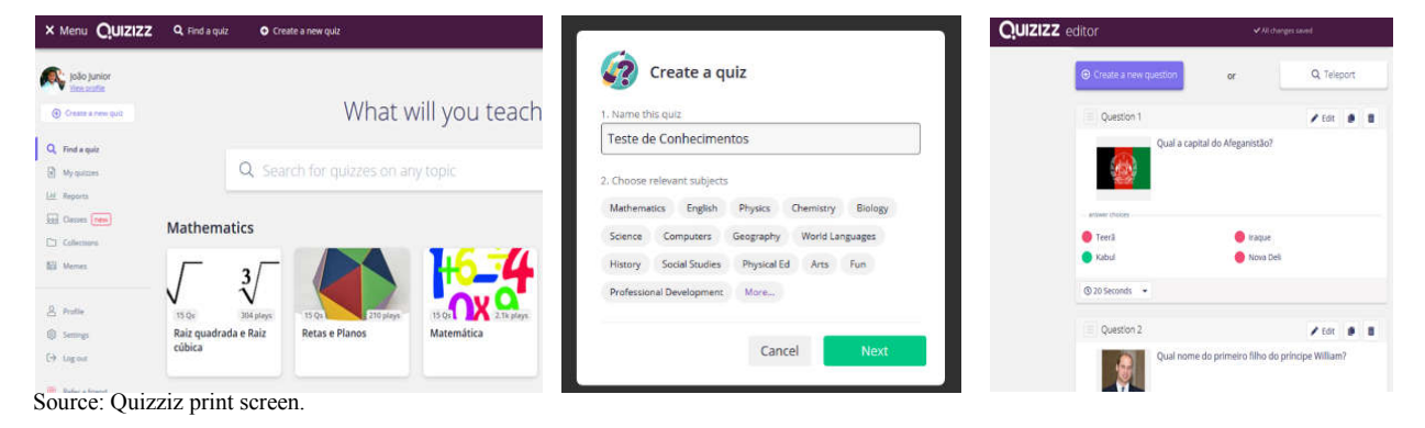
Figure 2. On the left side, the screen shows as an option to pre-made tests, in the centre of the screen there is the option to create a customized test, on the right side, an example of completed tests