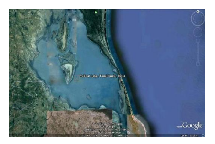
Fig. 1. Shows the Pulicat Lake.

The present study is an attempt to examine the occupation, socio economic status of fishermen, women and child at the fishers in two village. These villages were chosen at random to emphasize the study of the role of men and women in communities primarily engaged in fishing and other activity. In this survey a large number of men, women and child were interviewed in all the two villages and an attempt was made to cover most of the fishermen in all the two villages (Madhumita et al. , 2011). Group discussions were held using many objects and topics like their professional occupation creative activities, compulsory activities, financial securities, health care, education, housing, etc. were discussed at length.