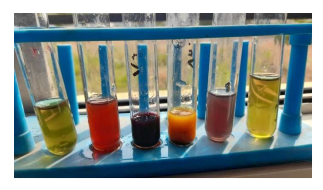
Fig. 1. Natural Dyes

in Maharastra (9), 15 plant species reported in Rajgarh (MP), in Uganda plant species are evaluated for colour absorption and fastness on cotton fabrics (10), 106 plant secies identified in Uttarakhanda, but no research found in Vijayapur district, Karnataka (2). per review Canna indica red flower produce light green colour, this plant is new reported in this research as per review.