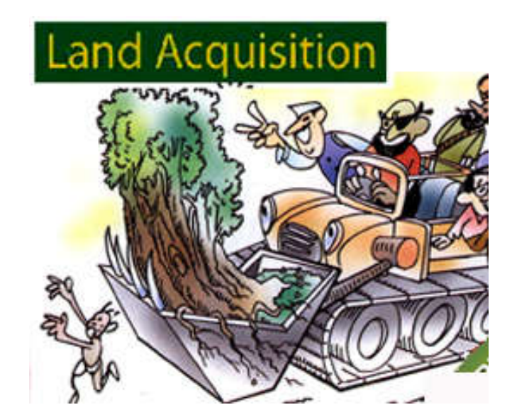
Strategy of displacement and rehabitation policy in current scenario

It is usually applied to leaders or other prominent individuals who regain their prominence after a period in which they have no influence or standing.