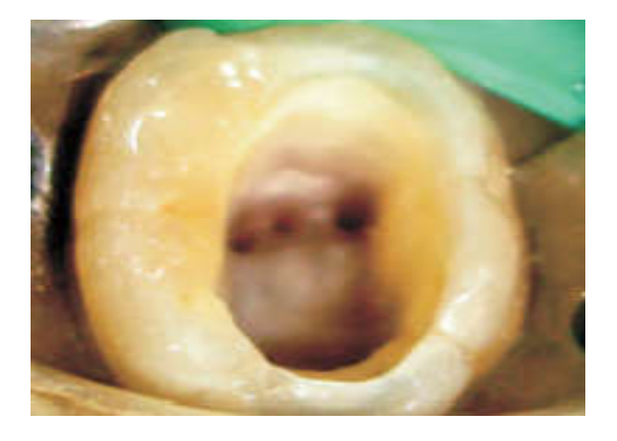
Figure 1b. Clinical photograph showing five canals

The clinical and radiographic findings led to a diagnosis of chronic irreversible pulpitis of the right mandibular second molar 47, necessitating endodontic therapy. Radiographic evaluation of the involved tooth indicated a deep occlusal caries approximating the pulp with apparently normal periapex (Figurea). After administering local anesthesia and rubber dam isolation, all carious tissue was remove an access cavity was prepared.Five orifices and canals were located (three mesial