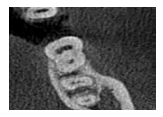
Figure 1d. CBCT image showing presence of five canals (coronal view)