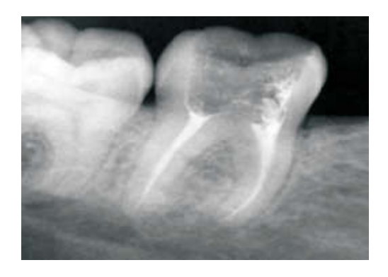
Figure f. Post-obturation intraoral periapical radiograph