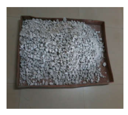
Fig 1. a. pumice aggregate

However, pumice is far from being fully utilized in lightweight concrete at the time being. Concrete structures are generally designed to take advantage of its compressive strength. Light weight aggregate (pumice) is procured from Turkey. The size of light weight aggregate is 20mm, Specific gravity = 1.06 and Water absorption = 30.15%.