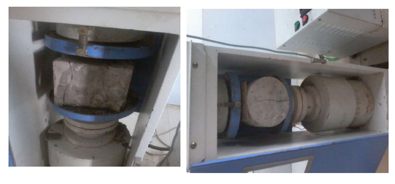
Fig 4. The compressive test and split tensile strength of concrete with fly ash and pumice