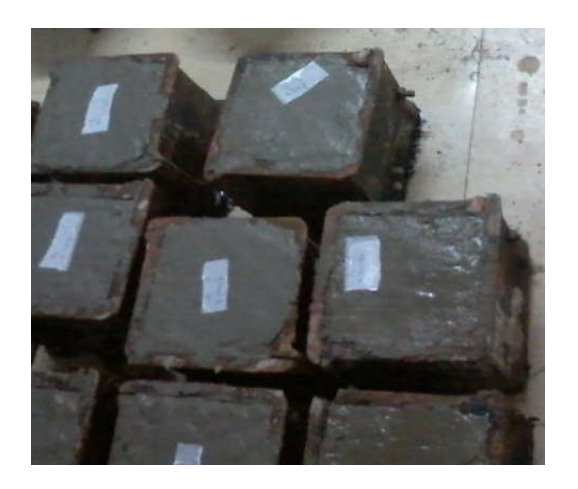
Fig 2(a) The Pumicecrete concrete cubes