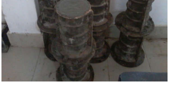
Fig 2(a) The Pumicecrete concrete cyclinders

Table 2. The mix design for quantity of water, cement and aggregates for a M25 grade concrete