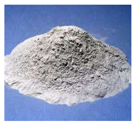
Fig 1. b. Image of fly ash

During mixing pumicecrete need, less cement to be used as it defeat the air entrainment of concrete either to natural colour of the stones or prepared surface to adher plaster over it.