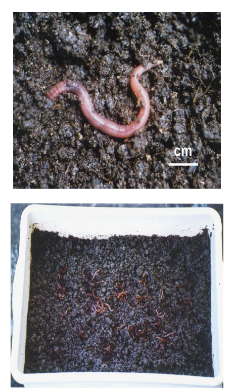
Figure 1 & 2: Eisenia foetida : Individual (left) and a culture box (right)