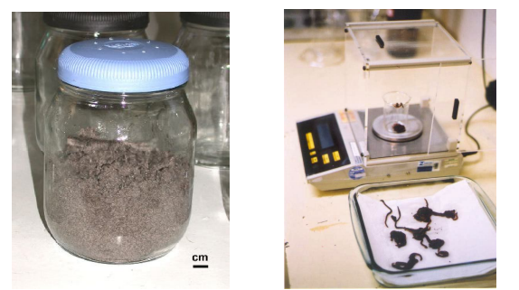
Figure 3 &4: Test vessel (left) and earthworm weighing (right)

The test system for the determination of the chronic toxicity of urea to earthworms was based on the guidelines OECD no. 222 (OECD 2003) and ISO-11268-2 (ISO 1998a). Only adult earthworms (with clitellum) with a fresh weight between 300 and 600 mg were used. Urea was mixed in different concentrations in the soil substrate and was applied only once at the beginning of the test. The test period was 56 days. Temperature for two artificial soils was maintained constantly throughout the test period. After 28 days, the adult worms, which had been exposed to urea, were removed from the test vessels and monitored for mortality. During the following 28 days, juveniles hatched from cocoons laid by the adults were investigated. Test parameters were mortality and biomass development of the adults 28 days after application and the number of juveniles 56 days after application. All the treatments were replicated in order to reduce experimental error. The data from this experiment were statistically processed using the Microsoft EXCEL 2007, including the calculation of average values, standard deviations and correlation.