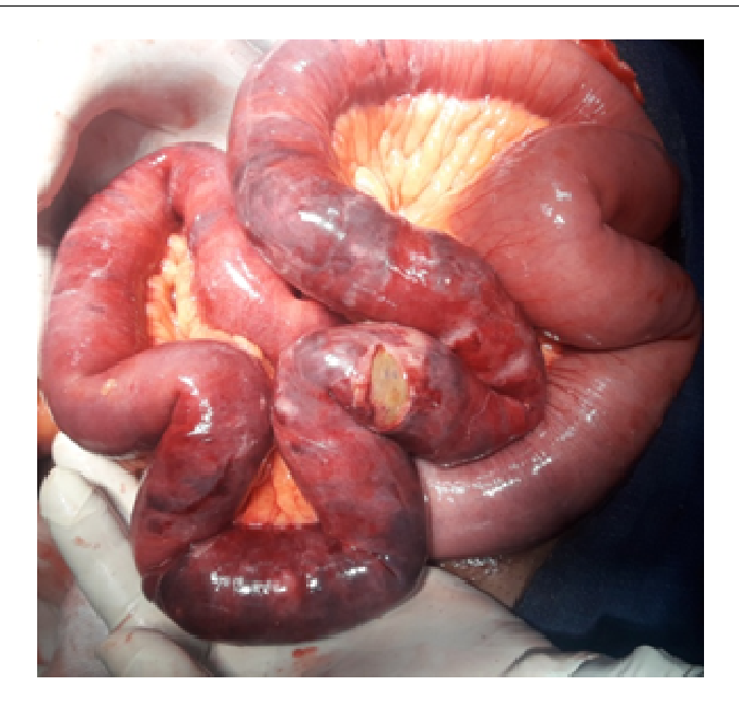
Figure 1. Shows intraoperative picture of bowel gangrene