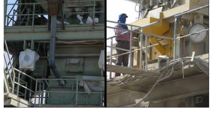
Figure 1. Local modified asphalt batch plants