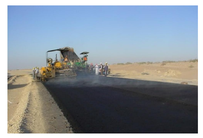
Figure 4. Fumes released from behind the paver

The monitoring equipment was installed in a mobile car parked on the shoulder of the road section under study (Figure 4). The mobile car was kept in the downwind direction of the paver. Readings were taken close to the source 20-40 cm above the auger level. This was done in order to measure the strength of the fume emission. In addition, measurements were taken at probe level of 1.8 m and 2.5 m (i.e. at the level of the foreman and paver operator). It should be noted that hot aggregate bins were kept to at least one quarter full at any time. The mixing temperature was set at 135-143°C for sulfur mix. The maximum hauling time was about 40 min ( \pm ). Sulfur mix was delivered to the site at temperature of about 125°C. At each point/level, a continous emission measurement of upto 5 minutes was done.