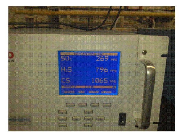
Figure 3. Thermo Electron Corporation 450i H<sub>2</sub>S/SO<sub>2</sub> gases analyzer

The average, maximum and minimum emission data of SO_2 and H_2S from the low concentration measuring analyzer are presented in Table 4. From the table, it can be seen that the SO_2 and H_2S concentrations are less than the concentrations defined by the OSHAA Standards for ambient air quality as listed in Table 5, along with local applicable standards.