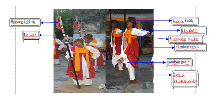
Fig 2. Costume Baris Jangkang Dance