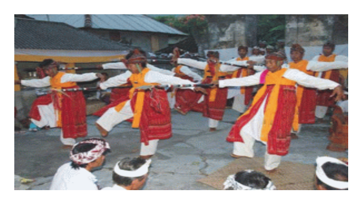
Fig. 1. Baris Jangkang Dance

many arise various arts associated with worship. Many have grown an art that is intended for a particular cult, or as a complement to that worship. In addition, there is an art performance that is entertaining. From freedom of expression in the framework of worship and as a supporter of a certain ritual, then in Bali is classified into two properties of performance or art. Ie sacred guardianship art and not sacral or called profane that only serves as a spectacle or amusement. Various types of Balinese dance show a close relationship with religious activities and also evolved into dances performed on stage. Both performing arts as a means of ceremony or ritual, as a fertility or limited to aesthetic presentation alone. The Hindu community in Bali in the art will be equipped with the ritual ceremony of offering (banten) according to their respective customs, where the ceremony will be based on philosophy (Maran, 2000; Anonymous, 2015).