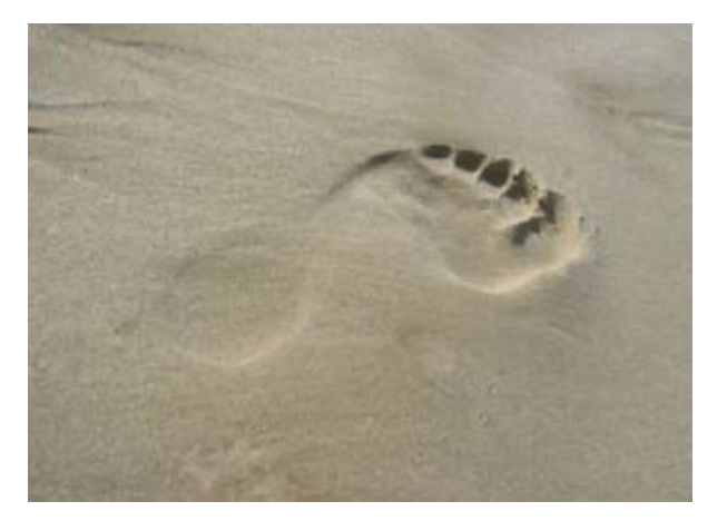
Figure 3.Trail of enlarged footprints (vestige)

Table 1.Data collected at the crime scene