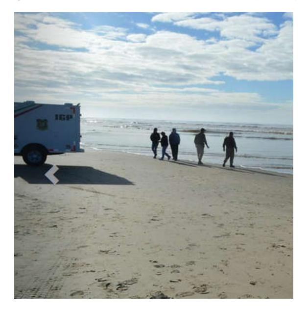
Figure 2. Traces of footprints.