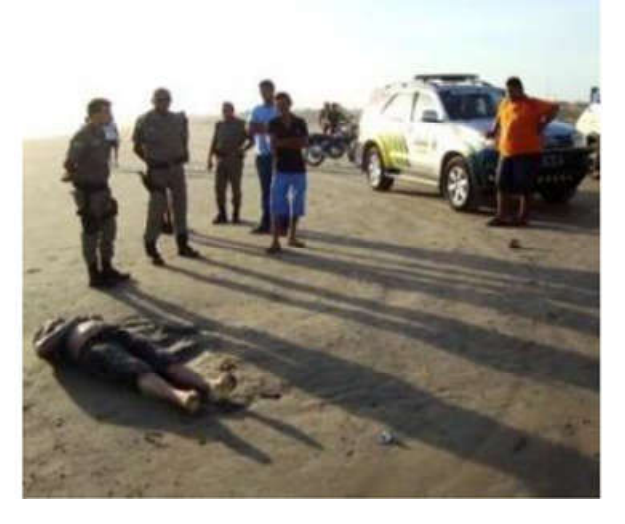
Figure 1. Victim and the scene of the crime scene