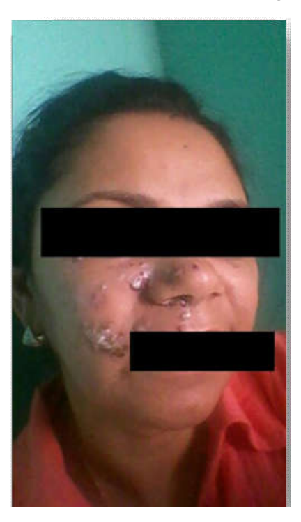
Figure 4. Crusty lesions and decrease of edema after initiation of treatment