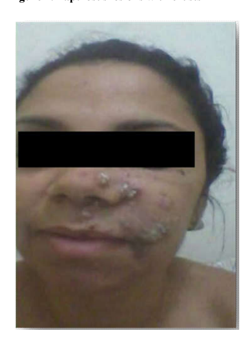
Figure 4. Lesions with crusts