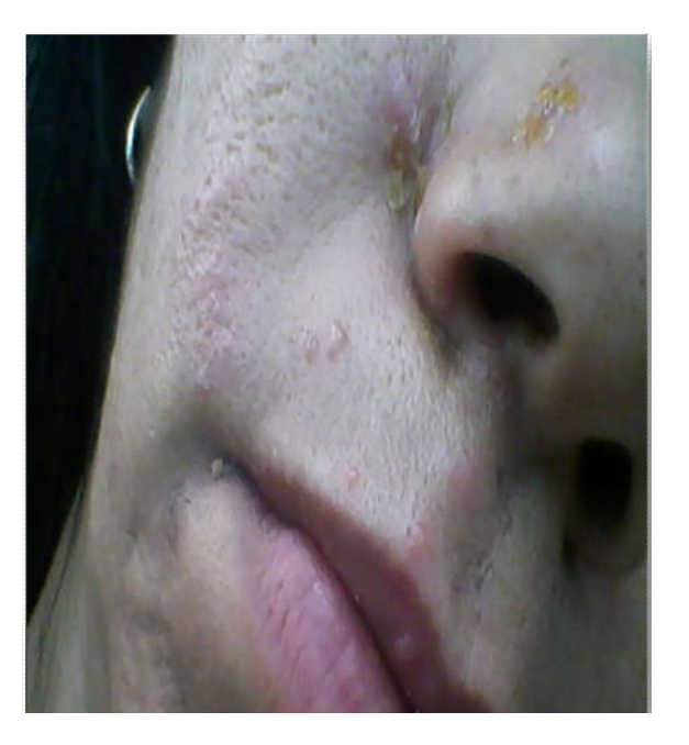
Figure 3. Vesicular and bullous lesions