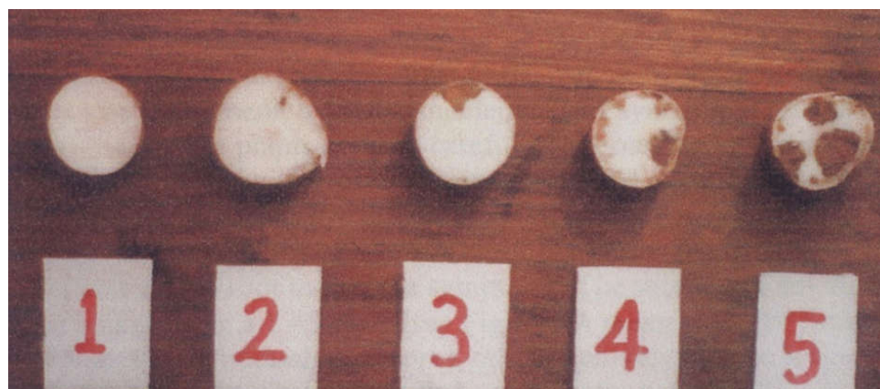
Figure 1. Root necrosis severity scores