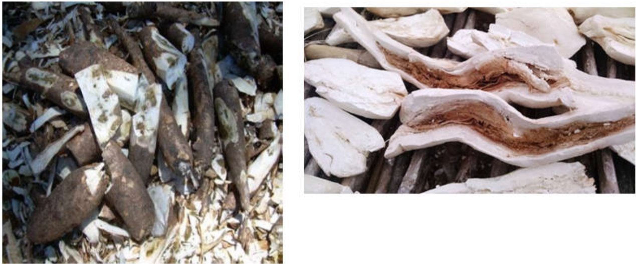
Figure 4. Photos of damaged cassava roots and chips with necrosis in Mfouati