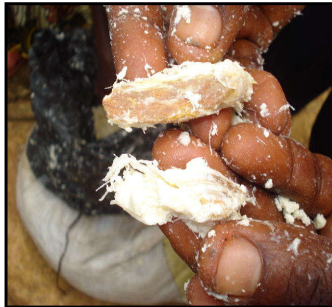
Figure 5. Photo of typical cassava root necrosis in Mfouati

A number of local cultivars have been identified both in Tanzania and Malawi that show tolerance to root necrosis. That is to say that the onset of root necrosis is delayed. The cultivar Nanchinyaya was the first of these tolerant types to be identified and it is now widely grown in the Mtwara region of southern Tanzania. Root necrosis may begin show after 5-6 months in the more sensitive cultivars but it is delayed until 12-18 months in Nanchinyaya. CBSD management in both Tanzania and Malawi is based on the multiplication and distribution of these tolerant local cultivars (Hillocks, 2002). Variety susceptibility variability to the disease is demonstrated by previous research findings in East Africa. Two cultivars, Kitumbua and Kiroba, found between Dar es Salaam and the Rufiji River were observed to have some resistance to CBSD (Hillocks, 2000). Some local cultivars, e.g. Nanchinyaya, have exhibited a form of tolerance to CBSD in which foliar symptoms appeared but the development of root necrosis was delayed allowing the full yield potential to be realized others cultivars like Kigoma Cheusi, Gomani and Songolo were also