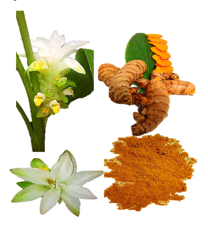
Figure1. Flower, rhizome, and powder of Curcuma longa

Alzheimer's disease, obesity and chemo-preventive. It also has activity against several types of cancers including aggressive and recurrent. Figure 1 shows some parts of the plant and the powder obtained from the rhizomes (He et al. , 2015; Mobasheri, 2012; Akuri et al. , 2017; Prasad, Tyagi, 2015; Wang et al. , 2017).