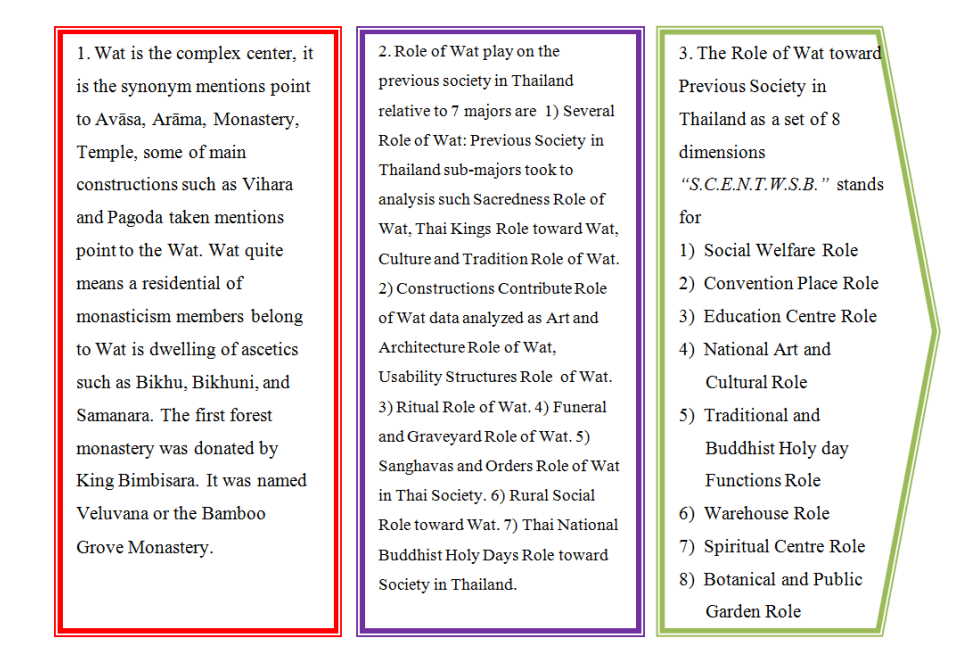
Figure 1. The three answerers of the research questions

In the spiritual role of Wat was the central of King, princes, princess, also layman and laywoman to pay homage the Buddha statues, to learn Dhamma as well as practicing, and observe the Precepts such as five or eight rules of morality. That is the five precepts to be observed by all Buddhists are; (1) to refrain from killing; (2) to refrain from stealing; (3) to refrain from sexual misconduct; (4) to refrain from telling lies; (5) to refrain from drinking intoxicants. On the holy day lay devotees generally observe the eight precepts, that is the five rules plus three more as; (6) to refrain from eating after midday; (7) to refrain from taking part in any kind of entertainment and from wearing perfume and ornaments; (8) to refrain from using high and luxurious couches. In the geography role of Wat was a botanical garden because various types of tree planting and growing in side and to become the forest of the city.