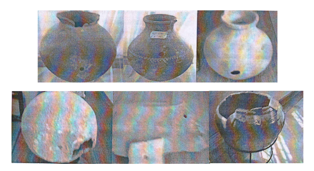
Archeological finds in Kültep