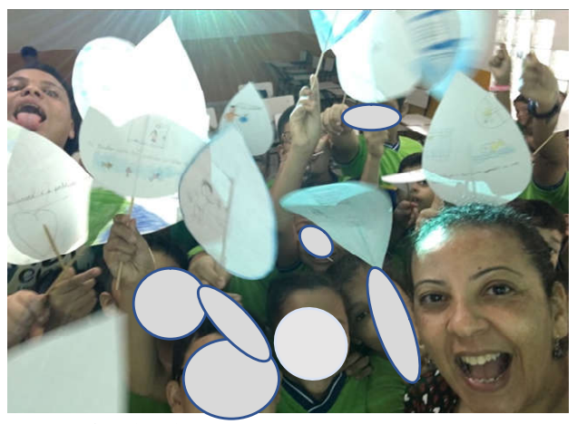
Figure 4. Lectures on the uses of water, water waste, etc