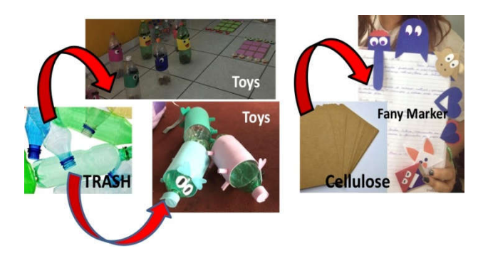
Figure 3. Activities developed by group 3 - Trash processing in toys

Group 3: This group is a continuation of the work of group 2, while it is done during the activity class as teacher of communication teachers. At this stage the materials of the day are used, such as PET bottles, bottle caps, used paper, etc. (Figure 3).