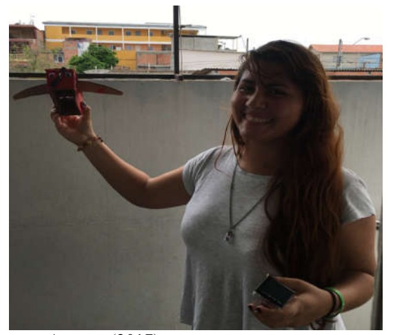
Figure 9. Group 3 Book Markers made with recycled paper / not