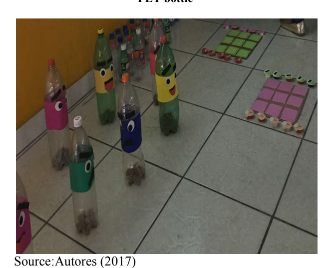
Figure 10. Group 3, PETbottlebowling and old set with PET bottle caps

Figure 8. Group 3 Workshop of recycled toys made with PET bottle