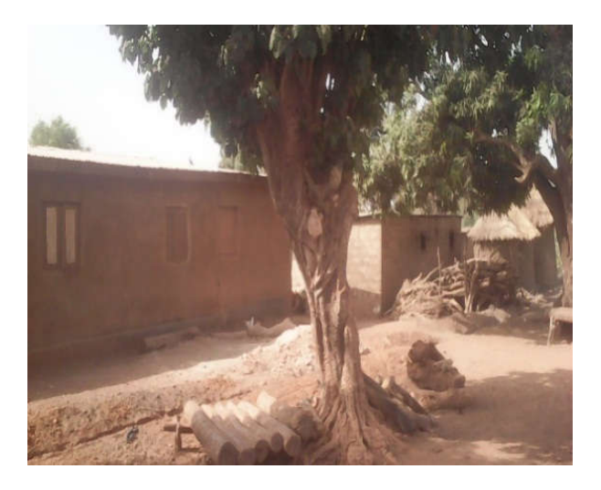
Photo1 round Box