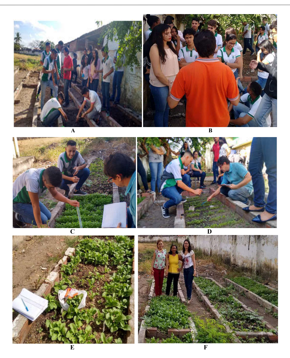
Figure 2. Extension project in the garden of Dom José Tupinambá da Frota State College, Sobral, Ceará (A and B) workshop with teacher and students, (C and D) coriander harvest and (E and F) arugula