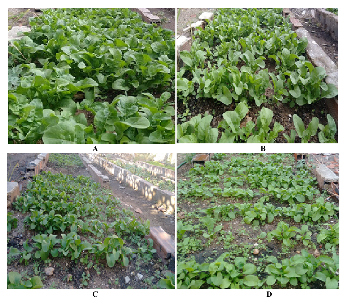
Figure 5. Extension project in the garden of Dom José Tupinambá da Frota State College, Sobral, Ceará, Brazil. (A and B) arugula plant growth in part of the goat manure beds in March 2018 and (C and D) arugula plant growth in part of the goat manure beds in August 2018

The results can be explained by the higher nutrient availability probably provided by the goat manure incorporated with longer time before sowing. This period probably provided higher yields due to a greater synchronization in the period of maximum crop nutritional requirement in relation to goat manure mineralization and consequently the nutrient availability to the soil which is determined by the C/N ratio. For Souza and Rezende (2006) the decomposition and rapid release of nutrients are of great importance for short cycle crops, such as arugula, as it allows the availability of nutrients in a timely manner for use during the crop cycle. Silva et al. (2008), when evaluating the cultivation of arugula fertilized with different organic residues, such as cattle manure, sheep / goat manure and earthworm humus, observed that the number of arugula leaves increased, whose increase was more accentuated with better manure plant performance. For Souto et al. (2005) the difference in manure decomposition time ensures a continuous flow of nutrients in the soil. Fontanétti et al. (2006), found that the absorption of nutrients from organic fertilizer mineralization by vegetables depends largely on the synchrony between decomposition and mineralization of waste and the time of greatest nutritional requirement of the crop.