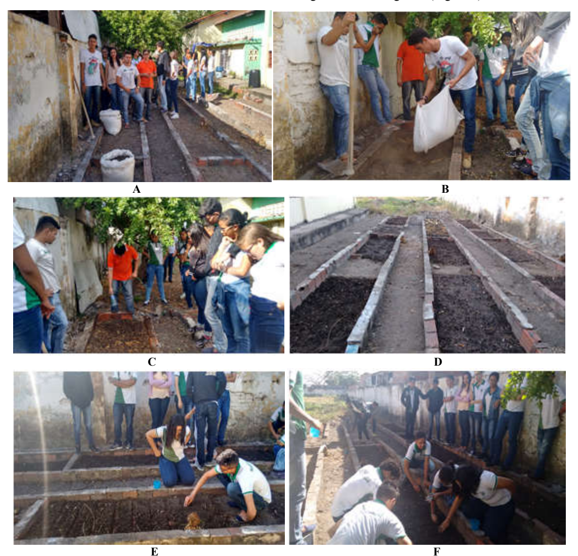
Figure 1. Soil preparation from the Dom José Tupinambá da Frota State School garden in Sobral Municipality, Ceará, Brazil. (A) soil decompression, (B) incorporation of goat manure into the soil, (C) irrigation of manure incorporated into the soil, (d) beds with decomposed manure and (E and F) vegetable sowing

The study was carried out in a garden of Dom José Tupinambá da Frota State College, located at 1100 Dr. Guarany Avenue, Cidao neighborhood, Sobral Ceará. The municipality is located in the semiarid region of Ceará and is at 3° 41 'S and 40° 20' W, with an altitude of 69 m. The annual averages of temperature and precipitation are 30 °C and 798 mm, respectively. The work was conducted by volunteer monitors, staff and students of the Dom José Tupinambá da Frota State College who assisted in the preparation of the flower beds, soil tillage, incorporation of manure into the soil, sowing of the studied vegetables and irrigation (Figure 1).