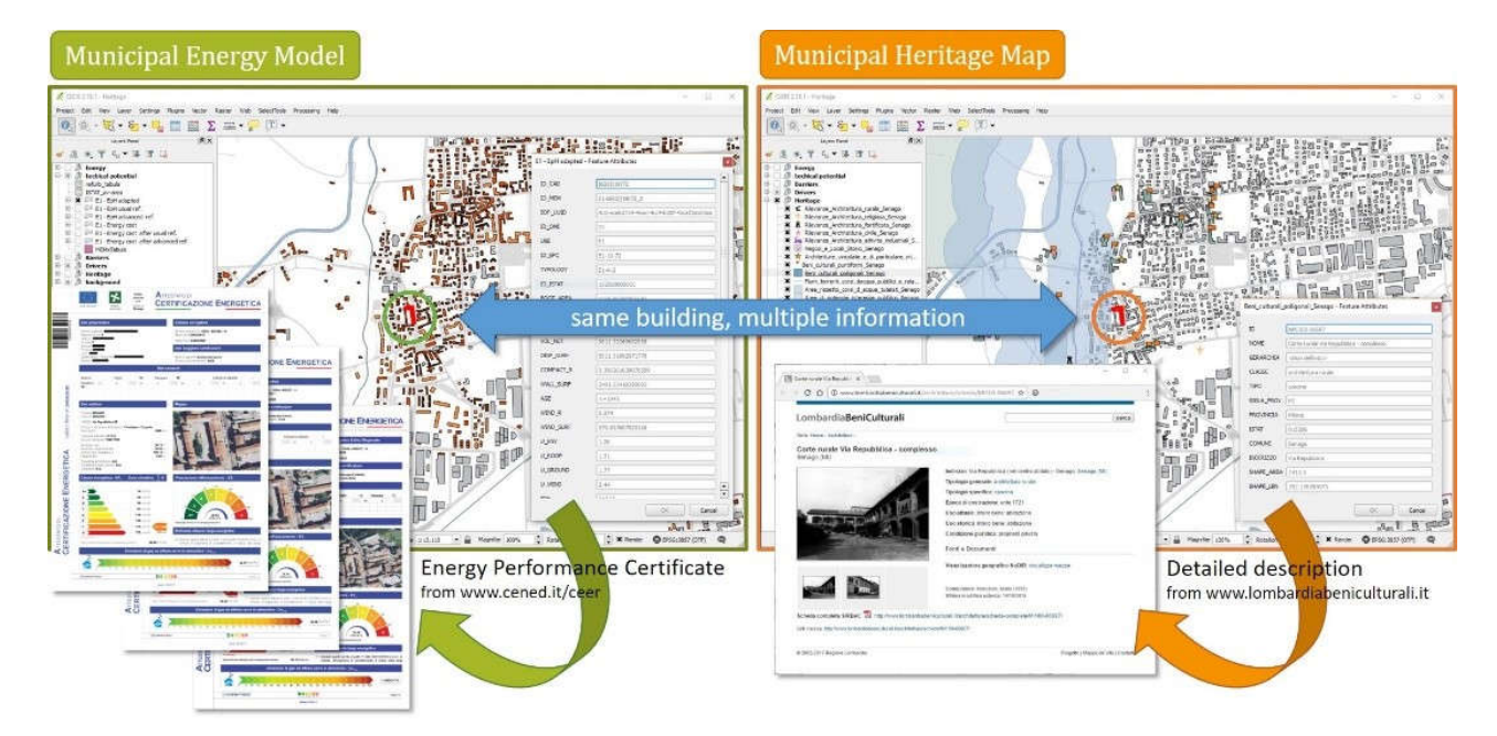
Fig. 3. Example of application of MEM and MHM; representation of the available information and use

Framework of the supporting tools: The supporting tools already developed in the previous works could thus be enriched by data about the building heritage. The intended users and the main features of the tools that arise from the MEM and linked MHM are listed in Figure 2. The Planning tool they represent the support for LEP provided by the MEM,