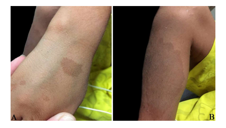
Figure 1. "Café-au-lait" spots located on the skin

Male 10-year-old leucoderma patient sought the Stomatology Clinic of a University Center reporting an increase in volume in the region of the hard palate. During anamnesis, the patient's mother reported that he had difficulty speaking and drooling. On extra-oral clinical examination, multiple "café-au-lait" spots spread throughout the body (Figure 1) were observed, which have been progressively appearing since birth, according to mother's report. These spots presented slow growth, without symptoms, bothering the patient due to their aesthetic character.