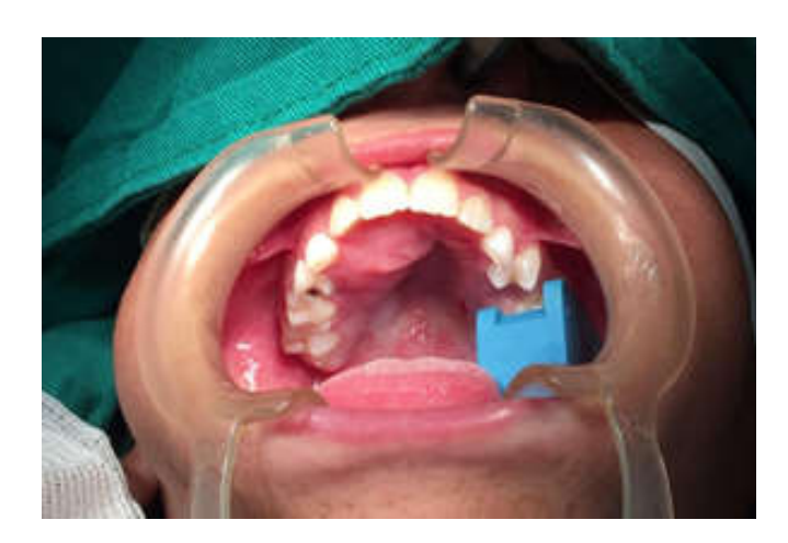
Figure 2. Intra-oral clinical examination evidencing a nodule located in the right region of the hard palate measuring approximately 2 cm diameter

The patient also showed some subcutaneous nodules, measuring from 2 to 20mm throughout the body, concentrating mainly on the forearms and back. Upon intraoral examination, a nodule located in the right region of the hard palate measuring approximately 2 cm in its largest diameter was observed (Figure 2), with mucous-like color and without ulceration areas, with evolution time of approximately two years. In the family history, it was found that the patient's mother had cutaneous nodules and "café-au-lait" spots, which were scattered on legs, arms, back and chest. On tomographic examination, an expansive lesion was observed in the region of the direct hard palate, without causing bone and/or root resorption, the lesion extended from the region of element 21 to element 55.