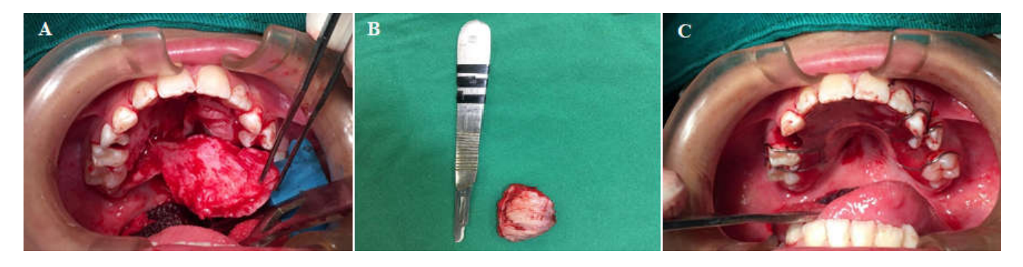
Figure 4. (A) Detachment for lesion excision was performed. (B) Total lesion removal. (C) The obturator palatal plate installed to protect the surgical wound