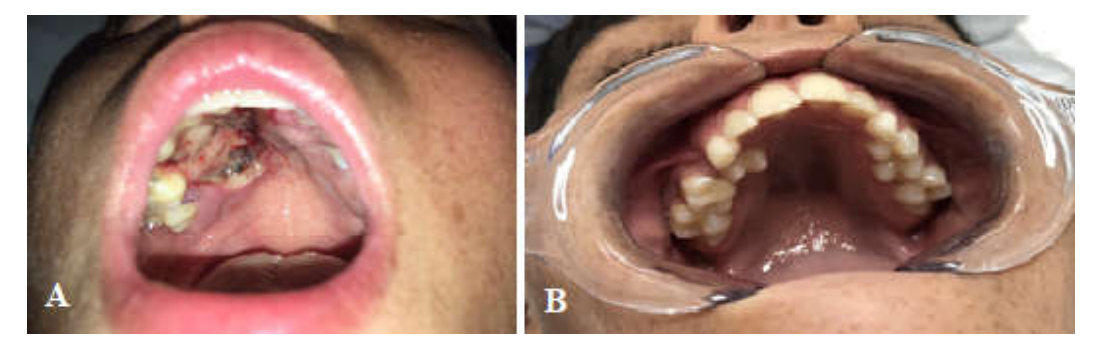
Figure 5. (A) Intra-oral clinical aspect ten days after surgery. (B) Follow-up after 18 months and no clinical evidence of lesion recurrence

After preoperative laboratory exams, surgical enucleation of the lesion under general anesthesia was performed. Perilesional incision bordering the peripheral limits of the lesion was performed using No. 15c scalpel. After incision, detachment for lesion excision was performed (Figure 4A), just after total lesion removal (Figure 4B). Simple stitches with