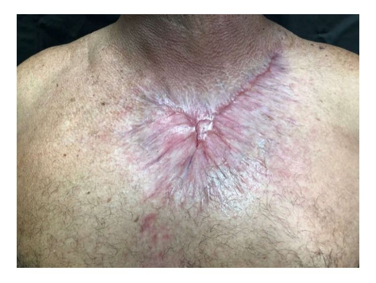
Figure 3. Case 1 - After excision

diagnostic hypotheses were basal cell carcinoma and squamous cell carcinoma. The biopsy performed showed a characteristic pattern of solid basal cell carcinoma. As conduct, the lesion was excised with a 0.4 cm safety margin. After detachment of the tissues and approximation of the edges with internal stitches using 4.0 monocryl thread, synthesis with nylon 4.0 was performed at pulley stitches in the places with the greatest tension, ending the primary closure of the lesion (Figure 5).