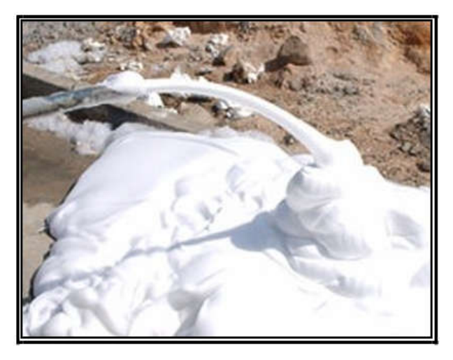
Figure 11. Foamy material.

Foam: The foam is obtained by foaming agents, which are products of chemical composition capable of producing stable air bubbles inside the cement and mortar paste (Associação Brasileira De Normas Técnicas, 1990). There are two types of foam extract: synthetic and organic. The foam extract must have a chemical composition capable of producing stable air bubbles in the concrete. They must resist the efforts generated by mixing, pumping and launching the material. Changing the specific gravity of the concrete until the start of the cement setting is the most appropriate way to assess the stability of a foam (Ferreira, 1986). The foam can be pre-formed for later incorporation into the mortar or generated within it by stirring in a special mixer. In both cases, the validity periods of the foaming agents, specified by the manufacturers, must be respected. Figures 11 and 12 show, respectively, the foam of synthetic origin, fundamental to produce cellular concrete, and the mixer, equipment where foaming agents are formed to be added to the mortar.