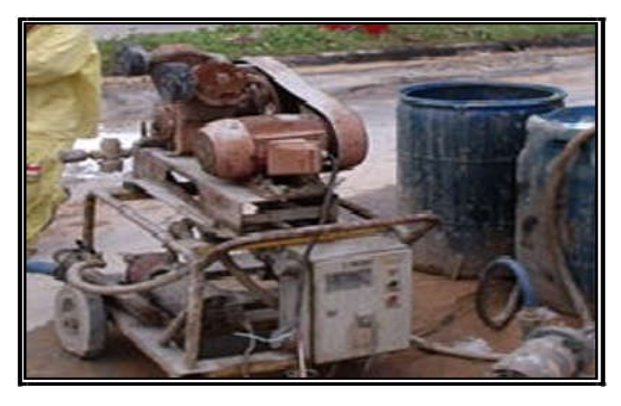
Figure 12 - Foam generator

Obtaining electricity from wind has many benefits being that function of system involves several physical and fundamental content. The basic principles for generating electrical energy from wind relate intimamentecom major themes studied by physics that can will serve as an auxiliary to the study of such content. The physical study of contemplating the wind passes by themes such as the formation of the wind, the mechanically made wind energy, the transmission of energy and asua transformation into electricity (58). The incorporation of fibers in cellular concrete aims to combat the stresses generated by temperature variations and shrinkage due to loss of water from the mass in the early ages, to increase the tensile strength in order to distribute any micro-cracks and, at greater ages, to