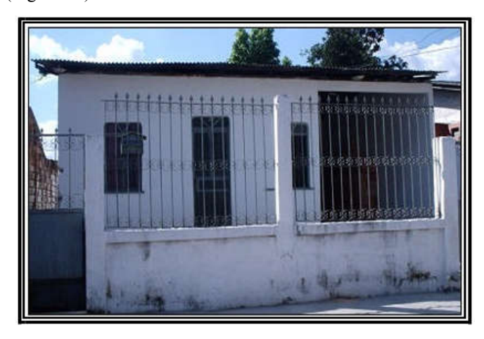
Figure 14. Housingunit of the Nova Cidade complex

Cellular concrete in amazonas: The technology in cellular concrete began to be used in the state of Amazonas, as masonry for popular housing, since 1982. Where, an Amazonian construction company was the pioneer in the use of cellular concrete, having produced in the period from 1982 to 1988, 1.200 houses in the "Conjunto New City Housing(40) (Figure 14).