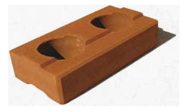
Figure 6. Modelofsoil-cementbricks.

Models of soil-cement bricks: Figure 6 shows the soil-cement brick model used in the construction of popular houses. The dimensions of the bricks commonly used in works are: 10 \times 20 \times 5.0 (cm), 12.5 \times 25 \times 6.25 (cm) and 15 \times 30 \times 7.5 (cm) (Grande, 2003).