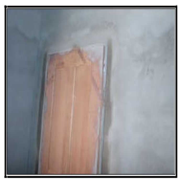
Figure 2. Plastered soil-cement wall

The walls of the housing units in aerated concrete were also executed in two ways: the first refers to the execution of reinforced masonry, that is, placement of welded steel screens on all walls before concreting (Figure 3), while the second form refers to the execution of partially reinforced masonry, that is, placement of the welded steel screens only in the wall encounters (Figure 4).