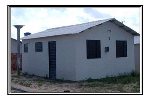
Figure 15. Housingunitof Conjunto Nova Cidade.

During the years 2000 to 2004, 8.595 housing units were built in cellular concrete in the "Conjunto Nova Cidade". Most of these houses were handed over to the most diverse classes of state civil servants (civil and military police, teachers, etc.). Another part of this very expressive number was also delivered to the low-income population that lives on the banks of rivers and streams, moving them to the houses of the "Conjunto Nova Cidade" (Figure 15).