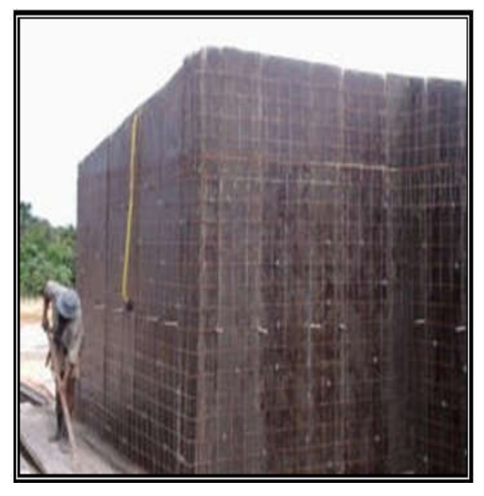
Figure 3. Reinforced cellular concrete wall.

The walls of the housing units in aerated concrete were also executed in two ways: the first refers to the execution of reinforced masonry, that is, placement of welded steel screens on all walls before concreting (Figure 3), while the second form refers to the execution of partially reinforced masonry, that is, placement of the welded steel screens only in the wall encounters (Figure 4).