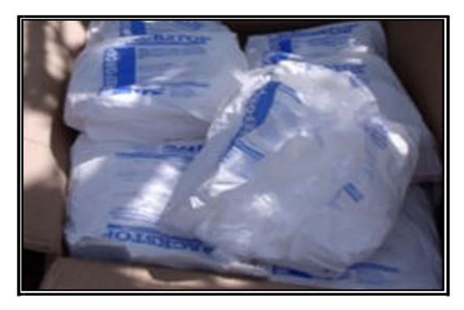
Figure 13. Packaging of polypropylene fibers

Additions: There are several types of additives for aerated concrete, each intended for a purpose, with the objective of giving concrete a certain characteristic such as increased resistance to mechanical efforts, improved workability, hygroscopy, decreased shrinkage, increased decreased durability, possibility of removing crimps and molds in the short term, decreased heat of hydration, retardation or acceleration of the handle, etc. (Ferreira, 1986). In the mixture, a super fluidizer is used, with the function of reducing the water-cement ratio, without the cellular concrete losing its workability, as well as increasing the initial resistance. With this, the retraction by hygroscopy becomes exceedingly small, in effect, the internal stresses decrease, tending to avoid the appearance of cracks. Super fluidizers make cellular concrete a low-viscosity liquid, which can be self-leveling and melted instead of vibrated (Teixeiram 1992). Although superfluidizers reduce the water needed for mixing by up to 30%, reaching water / cement ratios of 0.28 to 0.30 and, consequently, high initial and final strengths, also with