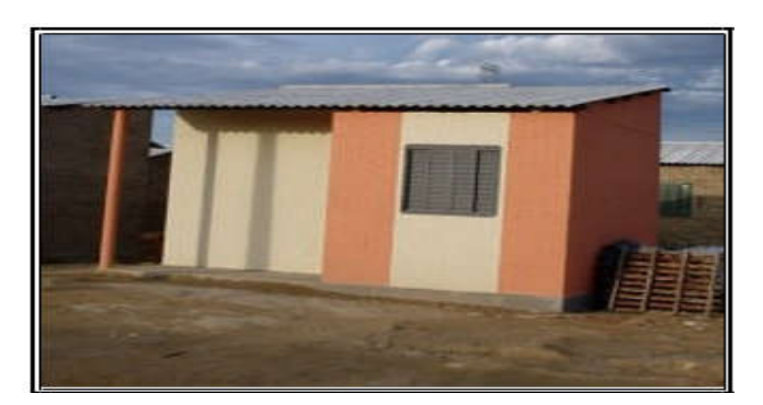
Figure 8. Soil-cement house ready to be delivered to the population

Thus, from January 2003 to August 2005, the state government built four housing developments that are part of the "Citizen Project", already delivered to the low-income population. The first is the "Conjun to Cidadão", with 478 housing units delivered in September 2003, the second is the "Conjunto Amine Lindoso", with 73 properties for people with leprosy, delivered on october 4, 2003, the third is the "Conjunto Carlos Braga", with 404 houses delivered on august 20, 2004, and the four this "Conjun to João Paulo II", with 1.320 houses delivered on November 27, 2005. It is important to highlight that the first three sets were built using the constructive technique of soil-cement, while the fourth set was built in aerated concrete. The area of the house is 33m^2 , builton a 128 m^{2} plot, meeting the standards of the Manaus master plan. Each house has a bedroom, a bathroom, a kitchen, a living room and a service area, and the population is delivered free of charge. In the state of Amazonas, there are very few private constructions that apply soil as a constructive technique. Among the few existing works, we high light the construction of an industrial shed (Figure 9) using soil-cement bricks as sealing masonry associated with there ticulated structure.