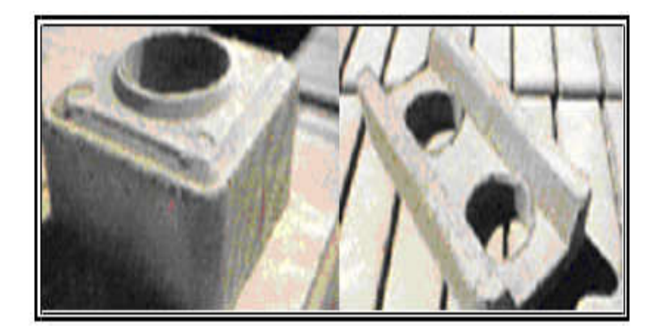
Figura 7. Modelo de tijolos de solo-cimento (25).

Figure 7 shows the half brick and the channel in soil-cement that are integral parts of the masonry in soil-cement.