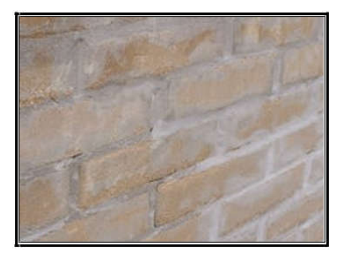
Figure 1. Grouted soil-cement wall.

The use of soil-cement and cellular concrete construction techniques has been aimed at rationalizing and industrializing construction, based on the following premises: developing affordable housing, using new materials of excellent quality and with great durability; to develop technologies using simple construction components with an industrial character, easy to assemble and with the possibility of expanding its original plant, reducing debris, and producing a safe and pleasant home for the user in terms of appearance, conservation and cleaning, thermal comfort and acoustic and watertight. The walls of housing units built in soil-cement were executed in two ways: the first with exposed bricks re-grouted with cement and sand mortar, in the 1: 3 line (Figure 1), while the second with plastered wall (Figure 2).