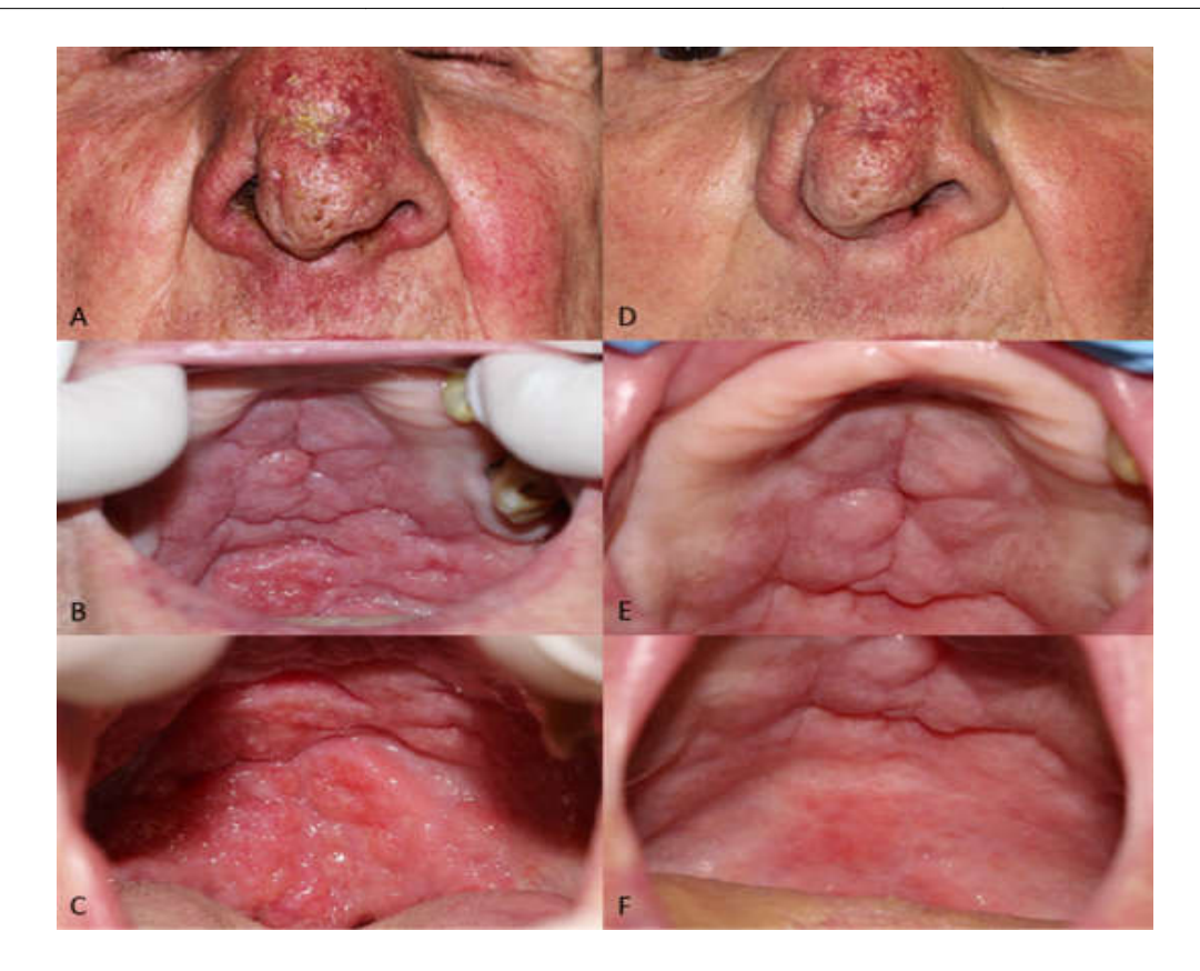
Figure 1. Lesions on nasal and oral mucosa skin before (A, B and C) and after treatment (D, E and F)