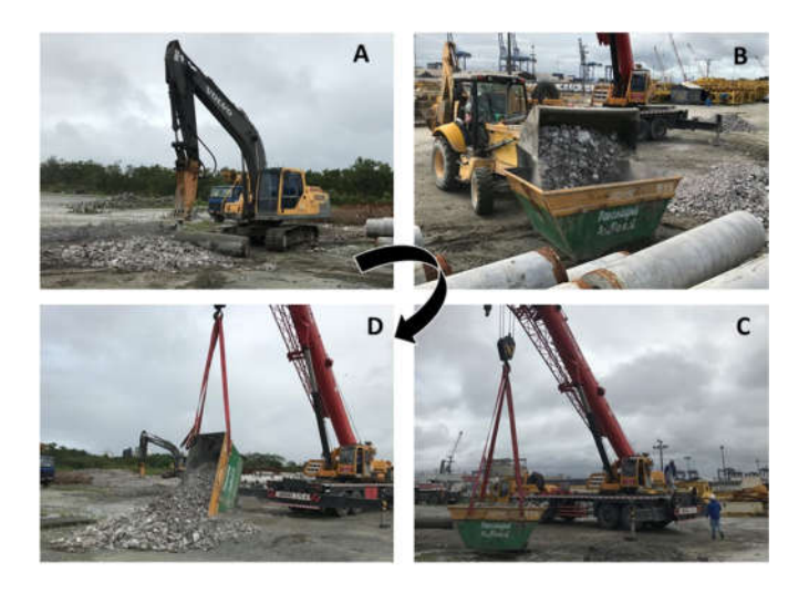
Figure 2. The sequence of activities of the second stage of investigation: A) breaks; B) load; C) weighing and D) discharge