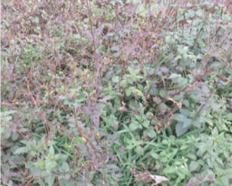
Sweet potato leaves