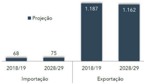
Figure 4. Import and export of Milk (million liters)