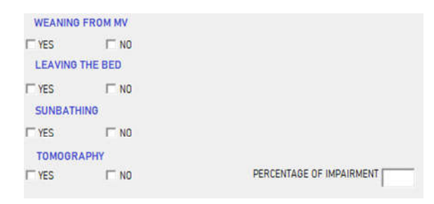
Figure 3. Multi-professional and humanization aspects of the ICU service

It follows a sequence of multi-professional and humanization items to aim and clearly justify to the staff the moment of care concerning the patient and if he/she enables activities for humanization during the ICU stay, and this set is performed by the criterion item "YES" or "NO". Its composition is the weaning from mechanical ventilation, leaving the bed, sunbathing, and chest tomography (field to score the percentage of lung parenchyma impairment).