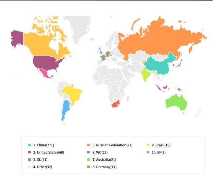
Figure 1. Main patent applicant countries on tailings dams (Derwent Database)

Part 1: INPI Patent Base Search. The survey returned 417 results, which were filtered in order to analyze only patents related to the safety issue in mining tailings dams. The initial filtering performed on the returned results showed 82 patents. After analyzing all the results obtained in the search and rejecting the results that were not considered relevant to the research, a list with 59 patents remained. Of these, seven did not have documents attached for analysis, being excluded from the research. A new filtering was done with the remaining 52 results, and after analyzing these documents, a total of 31 results were excluded. Table 1 shows the 21 patents obtained as a result of the search related to the study after data processing. Some of the patents described in Table 1 were considered as most relevant to the research and will be described in the article.