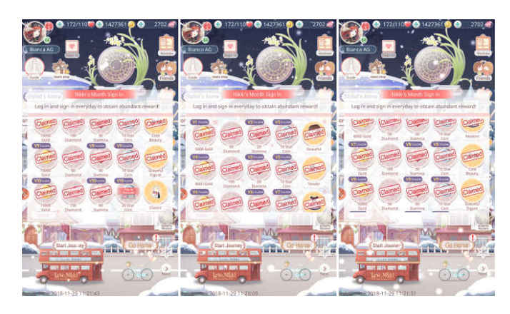
Figure 4. Rewards for consecutive days of login

Data collection and analysis: To carry out the analysis of the game, LoveNikkiwas played for thirty consecutive days without a break. It was played from November 2<sup>nd</sup> until December 2<sup>nd</sup>. The counting of the diamonds amount startedin zero. And for the purposes of this article were used in the game only diamonds won in the period between2<sup>nd</sup> Octoberand3<sup>rd</sup> November (30 days). I chose to play for 30 days because every consecutive day that the player logs into the game, for 30 consecutive days and at every 30 days, he gets a reward, and within those 30 consecutive days there are six days that the reward is diamonds. In addition to diamonds, the rewards are gold, heart (you need to spend heart to have attemps to play in story mode levels), clothes and coins to exchange in the Stylist's Arena mode. The player receives Diamond Reward on the following login days: Day 2 - 50 Diamonds, Day 7 - 100 Diamonds, Day 12 - 50 Diamonds, Day 17 – 100 Diamonds, Day 22 – 50 Diamonds, Day 27 - 150 Diamonds (Figure 4).