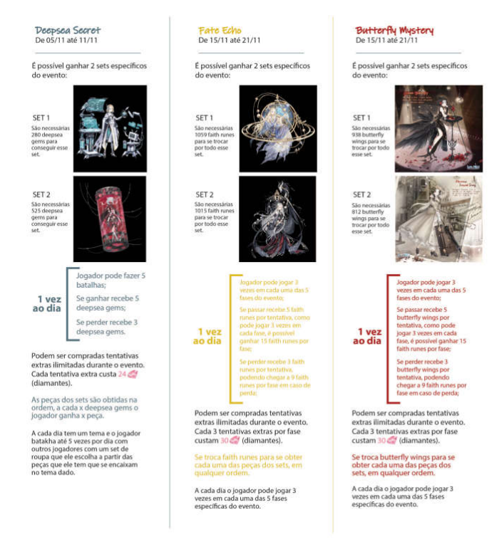
Figure 5. Game eventplayed

battles, win three Stylist Arena battles, Play 16 story mode stages, give hearts to friends ingame, create a clothing piecefrom a recipe, decompose three pieces of clothing, like 10 times the sets put on display by other players, buy two items in the store and participate four times in the Room of Mystery. During this 30-day period, the game was logged every day, playing the regular phases, completingall daily tasks, and participating in three game events: The Deepsea Secret (ran from 05/11 to 11/11), Fate Echo (ran from 15/11 to 21/11) and the Butterfly Mystery (occurred from 25/11 to 01/12). The diagram below, shown in Figure 5 shows how each one of those events worked. During the game, it was not possible to acquire any clothes set in the first event (Deep Sea Secret) due to lack of diamonds, however it was possible to obtain the Set 1 of the second event - Fate Echo by completing the missing clothes with diamonds. In the third event - Butterfly Mystery, Set 2 was obtained, also being necessary to use diamonds to buy extra chances to play in the stages to obtain the set.