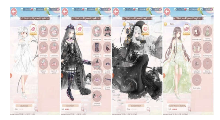
Figure 1. Purchased and unpurchased clothes sets

the details of the clothes such as laces, fabrics, textures, among others are very well worked in the illustrations. In this game, the player has his wardrobe and as he progresses through the stages and modes, he receives pieces of clothing. The pieces of clothing are used to assemble several sets of clothes in the game, these sets are arranged in a gallery and when the player completes the set (acquiring all the necessary parts) earns a reward: it can be either items to buy parts or other parts or both, and the clothes gallery will be colored according to the purchased sets. As shown in Figure 1, unpurchased sets are in black and white and purchased ones remain colored (Figure 1).