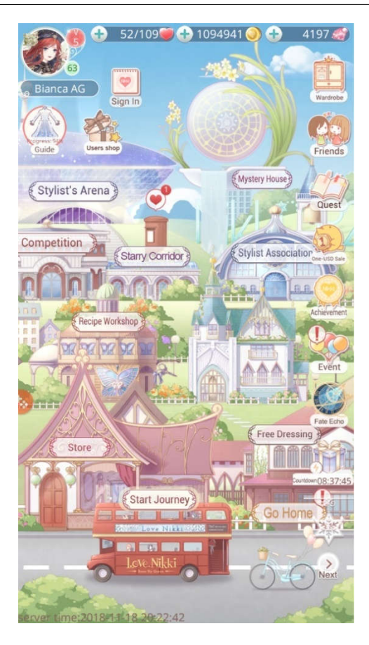
Figure 2. Game modes

In battle, in addition to the set, the player can use skills that will help her to win the battle, such as the skill that increases the score, or the skill that lowers the opponent's score or the one that makes the opponent sleep and stops the skill usage for a while. When the player loses a battle, he gets rank F, when the player wins a battle he can get rank S, A, B or C based on the player's score. Only if the players is able to reach rank S or A, he is rewarded with the clothes item(s) from that stage/challenge. In addition to the game modes described before, the player can dress up their own avatar in the game, improve their battle skills, create clothing items from recipes provided in the story mode, can decompose clothing pieces to gather special materials that serve to create new ones, can take pictures of their clothing sets and put them in the Starry Corridor space where other players can look, like and comment, also the player can go to their house and decorate it.