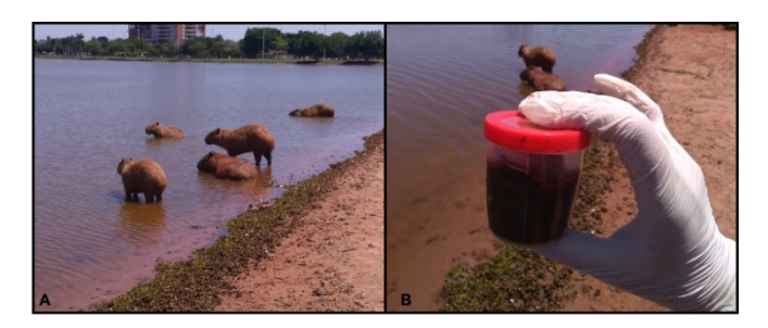
Figure 2. Collection of samples: A. Some capybaras found inhabiting the Lagoa Maior region. B. Collection of fresh stool samples in sterile vials for each sample, containing preservation solution

higher, and where they spend most of their time feeding. Region 1 is located near the coordinates of 20°46'59.3"S and 51°43'11.3"W; collection region 2 was located near the coordinates of 20°46'50.1"S and 51°42'52.9"W; and region 3 was located in an area of environmental preservation, located at coordinates 20°47'05.9"S and 51°42'48.3"W (Figure 1). Randomized collections were carried out, totaling 20 samples per collection.