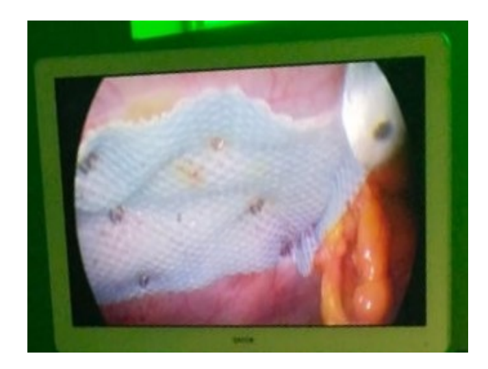
Fig. 1. Mesh placed intraperitoneally during first surgery

USG revealed Abscess in abdominal wall above mesh. The Plan to enter peritoneum, asses' status and possibility of removal of mesh was discussed and after consent the patient was taken up for surgery.