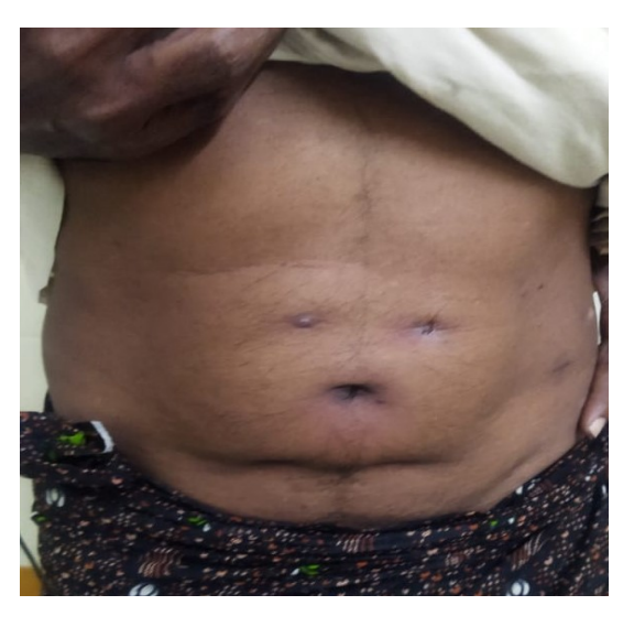
Fig. 2. Clinical photo 6 months after 1st surgery