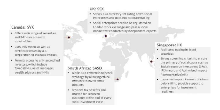
Figure 2. Key Features of Some SSE Models, Adapted from KPMG, 2020

Social Stock Exchanges around the world mostly follow the Community Crowdfunding model. The IOSCO paper highlights the difference between community crowd-funding and financial return crowd-funding: Community crowd-funding does not provide any financial return in the form of a yield or a return on investment. The Impact Exchange (Singapore) is based on a crowdfunding model that enables mature social enterprises to raise capital by issuing securities to a broader group of investors on a public platform that will facilitate trading in listed securities on a regulated stock exchange. It exposes a global base of impact investors looking for transparent, liquid investment opportunities. Social Venture Connexion (Canada) allows Private Offers from accredited investors as well as the raising of funds from the general public. As mentioned earlier, Kickstarter, Indiegogo, etc. (USA) allow social lending and reward crowd-funding for social enterprises.