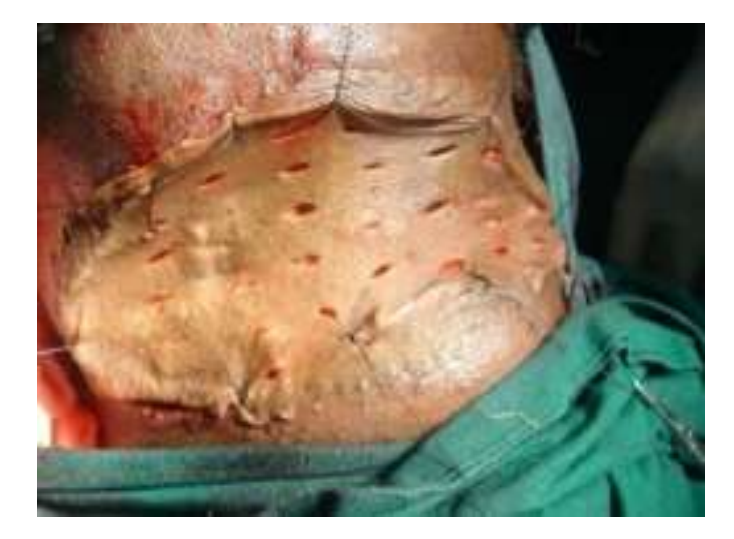
Figure 3. Case 1. The raw area was covered primarily by single sheet of meshed split skin graft of medium thickness