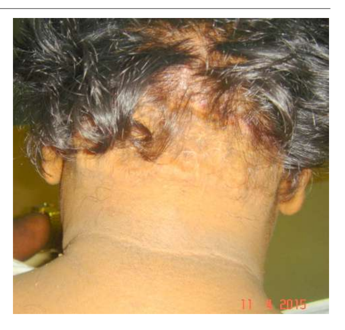
Figure 10. Case 2. Postoperative photograph after 1 year

Bazin in 1872 first named this lesion as Acne Keloidalis (Cosman and Wolff, 1972). This idiopathic inflammatory condition is most commonly seen in young African-American men after puberty, representing approximately 0.45 percent of all dermatoses affecting African Americans. (Ogunbiyi and George, 2005) The male-to-female ratio is approximately 20:1, and these cases are rarely reported in women (Dinehart et al., 1989). The cause of this lesion is unknown and is not a true keloid and has no relationship with Acne Vulgaris. Many have proposed an etiology similar to that of pseudofolliculitis barbae, implicating the action of hairs curving into the skin leading to a foreign body inflammatory reaction (Kelly, 2003). Close shaving of hair in the low neck area with the curved, coarse type of hair that is typically seen in black patients has been proposed as an etiological factor in 90 percent of AKN cases (Salami et al., 2007). But such an appearance is not seen in our patients.