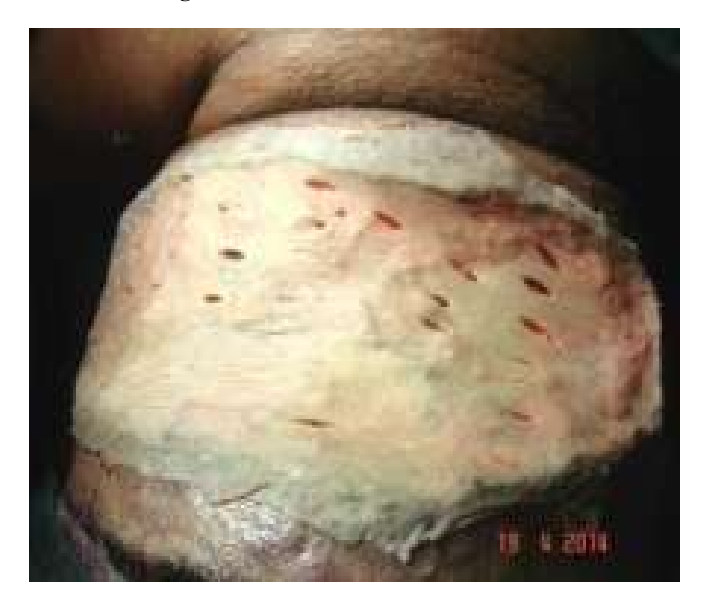
Figure 8. Case 2. The raw area was covered primarily by single sheet of meshed split skin graft of medium thickness