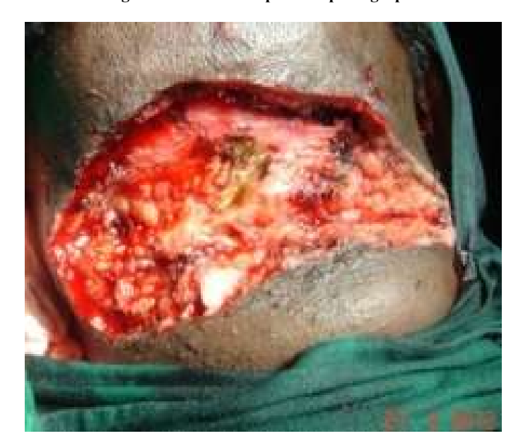
Figure 2. Case 1. Excision was performed in a horizontal elliptical fashion