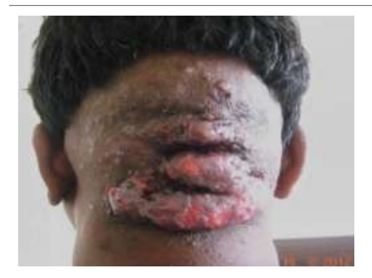
Figure 1. Case 1. Preoperative photograph