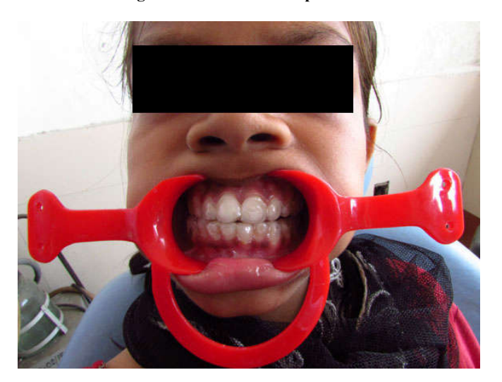
Fig. 5. Intra oral placement of mouth protector