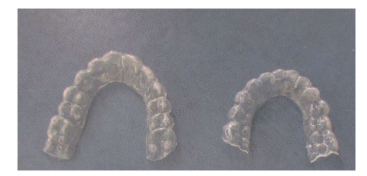
Fig. 4. Fabricated mouth protector