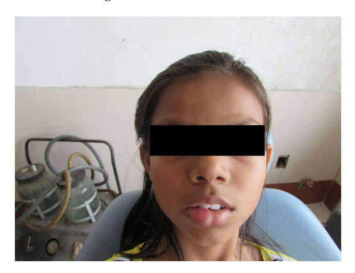
Fig. 2. Swelling found in lower lip