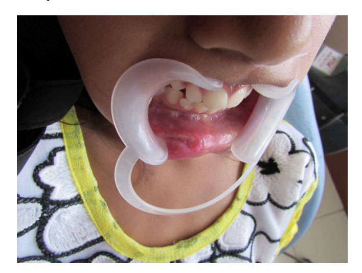
Fig. 1. Unhealed oral ulceration

miraculous result. The affected ulcerated area on the lip found healed satisfactorily after three weeks (Fig. 6). During that period patient was advised to wear the appliance constantly even during eating and even in night during sleep. Patient was recalled every week for re-evaluation for three weeks for checkup.