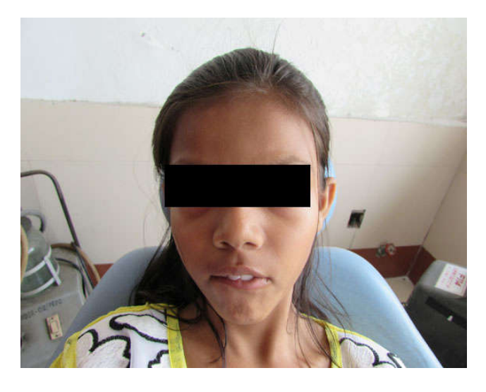
Fig. 3. Patient traumatizing her lip mucosa