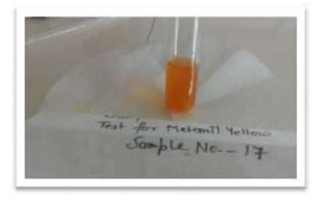
Fig. 3. No colour change