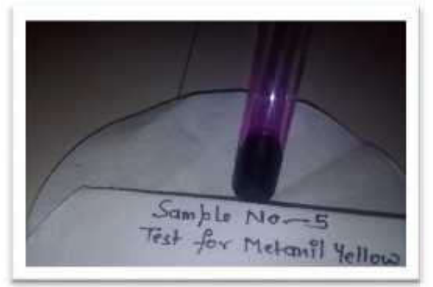
Fig. 2. Suspected sample shown pink colour during colour test of Metanil Yellow