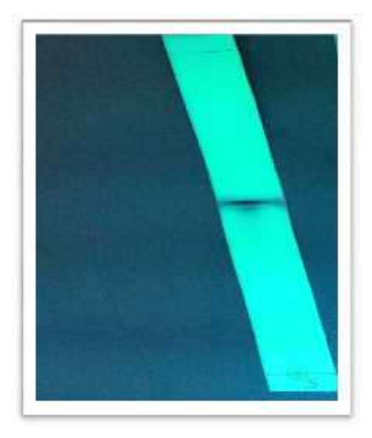
Fig.7. Developed TLC for standard