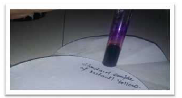
Fig. 1. Standard test sample of Metanil Yellow shown pink colour

standard sample of malachite green dye in which Cake samples S1, S2, S3, S4, S5, S6, S7 and S8, Pastry samples S9, S10, S11, S12, S13, S14, S15 and S16 and Ice-Cream samples S17, S18, S19, S20, S21 and S22 were taken for test of Malachite Green dye in which 2 samples of Cake as S1 and S6 and 2 samples of Pastry as S9 and S15 were found to be presence of Malachite Green dye. The data collected from the chromatogram were recorded and the Rf values were calculated through distance travelled by solute / distance travelled by solvent. The chromatogram of samples of Cake as S1 and S6 and S6 and Pastry as S9, S13 and S15 in figures (7) and (8), shown the similarities between suspected and standard samples of Malachite Green dye and according to table (4.5), the Rf values of suspected samples were matched with Rf value of standard sample of Malachite Green dye.