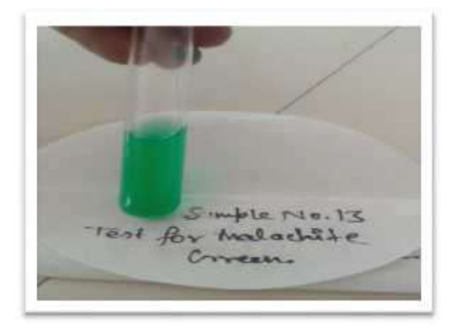
Fig. 6. No Colour change