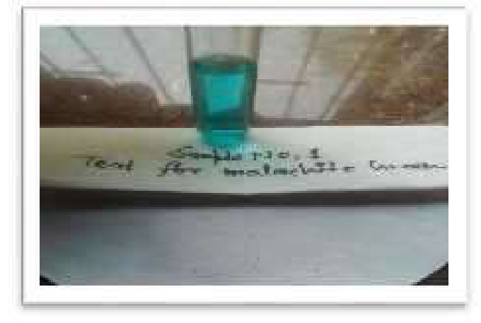
Fig. 5. Suspected sample shown disappearance of green colour