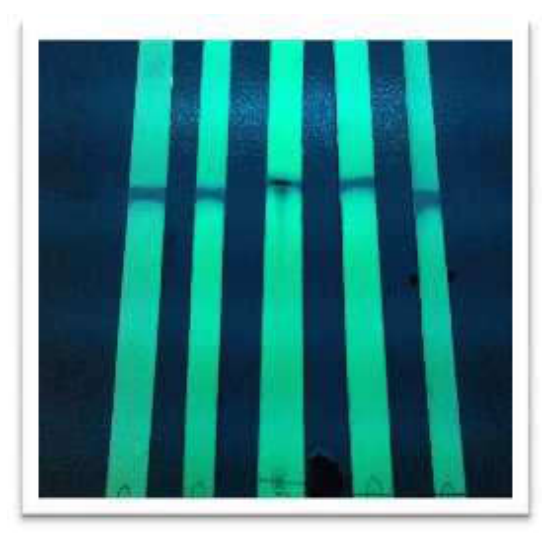
Fig. 8. TLC for suspected sample