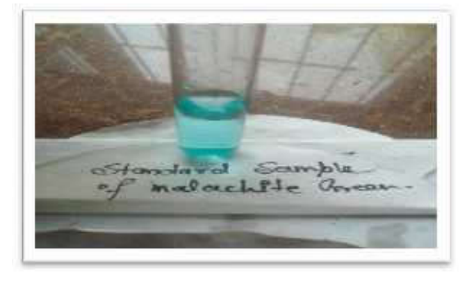
Fig. 4. Standard test sample of Malachite Green

The data collected from the chromatogram were recorded and the Rf values were calculated through distance travelled by solute / distance travelled by solvent. The chromatogram of samples of Cake as S3 and S7, samples of Pastry as S12 and samples of Ice-Cream as S17 and S21 in figures (9) and (10), shown the similarities between suspected and standard samples of Metanil Yellow dye and according to table (4.6), the Rf values of suspected samples were matched with Rf value of standard sample of Metanil Yellow dye.