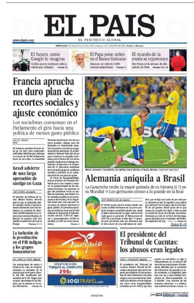
Figure 5. Front page of the newspaper El País on July 9<sup>th</sup>, 2014