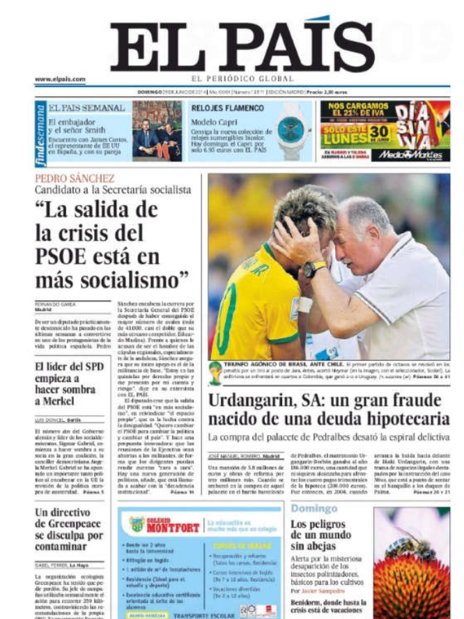
Figure 3. Front page of the newspaper El País on June 29th, 2014