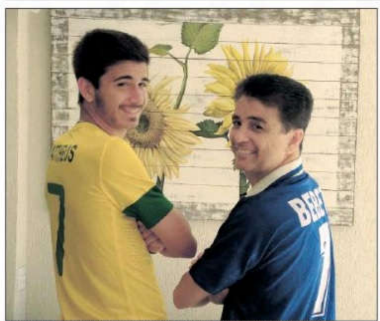
BEBETO Campeón con la selección brasileña en 1994 y exjugador del Depor

"A España solo le faltaba la victoria mundialista para darle credibilidad