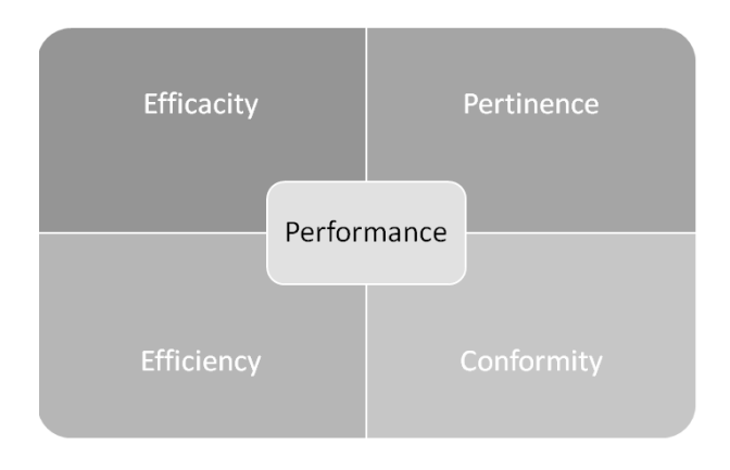
Fig. 1. Performance monitoring concepts

Historically, accounting and financial information were of the utmost importance in the organization. Thus, the first type of audit developed is the financial audit aiming to verify information compliance. Today, financial aspects are more related to the success of operational and strategic processes, which triggers the need to develop a long-term vision of the organization's profile and appetite to risks. Throughout performance monitoring, four concepts can define the degree of goal achievement: