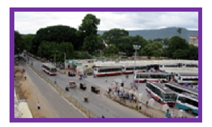
Figure 4. Mysuru city Bus Stand

In Bangalore-Nilgiri Road in front of main gate of palace footpath condition is fair but in other side of street, there is not footpath which has to been provided. Footpath condition in this area has high importance as has located in front of main gate of the most important historical land mark; palace which is the most tourist populated area. According to figures lack of appropriate footpath with required facility is observed in street which has linked to Jagan Mohan Palace. Existing of so many hawkers and vendors in Irwin Road cause to confliction between vehicles and pedestrians in Mysuru city. Inappropriate surface and lack of required width of footpath made major issues which have to improve. Inappropriate surface condition of footpath, existence of unshaped trees in the middle of the pavement which doesn't have shadow, park of vehicles in footpath according to figures which make distribution and non-existence of appropriate lighting along the footpath is evident.