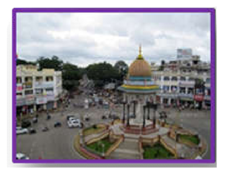
Figure 6. KR Circle

In Suburban Bus Stand's footpath confliction between vendors and autos, bikes and bicycles which are crossing through footpath is observed. Discontinue footpath without shady trees, adequate lighting and required width also provoked the existing issue.