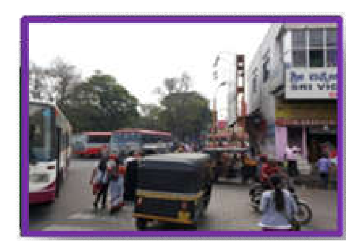
Figure 5. Suburban Bus Stand

Unidentified entrances for bus stand that cause to confliction with pedestrian behaviour and discontinue pedestrian footpath which force people to flow to roads are evident.