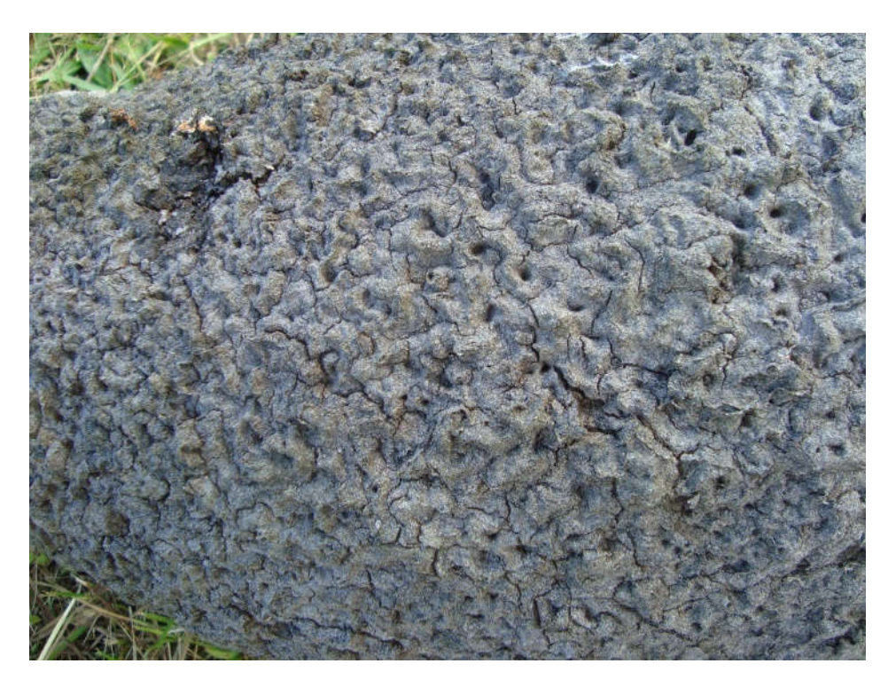
Figure 7. Nest of Nasutitermes ehrhardti (close view)