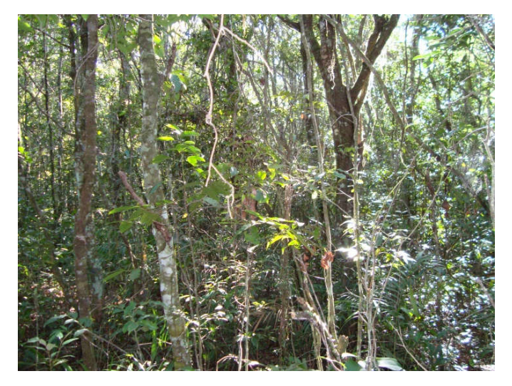
Figure 3. Forest of restinga (internal view) –Ubatuba, São Francisco do Sul, Santa Catarina State, Brazil