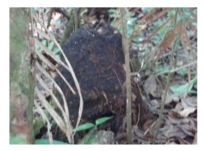
Figure 5. Epigeous nest of Anoplotermes pacificus Arboreal termites (Termitidae)

Glyptotermes canellae - A single sample was obtained, consisting of workers in the soil of restinga .