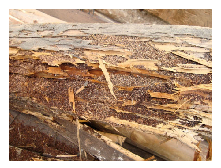
Figure 4. Damage caused by the action of termites of the species Cryptotermes brevi on the wooden roof rafters in the Raft Room at the National Museum of the Sea, São Francisco do Sul, SC. Ceiling lying on the floor

alive in the surface; one of the nests surpassed the foliage, with basal width of 30 cm and height of approximately 50 cm (Figure 5), the other one grew supported on a tree root, presenting a basal width of approximately 20 cm and a height of 60 cm. Its surface had very dark areas of recent growth, interspersed with others partially covered by bryophytes and, then, greenish. This nest was partially invaded by Nasutitermes itapocuensis .