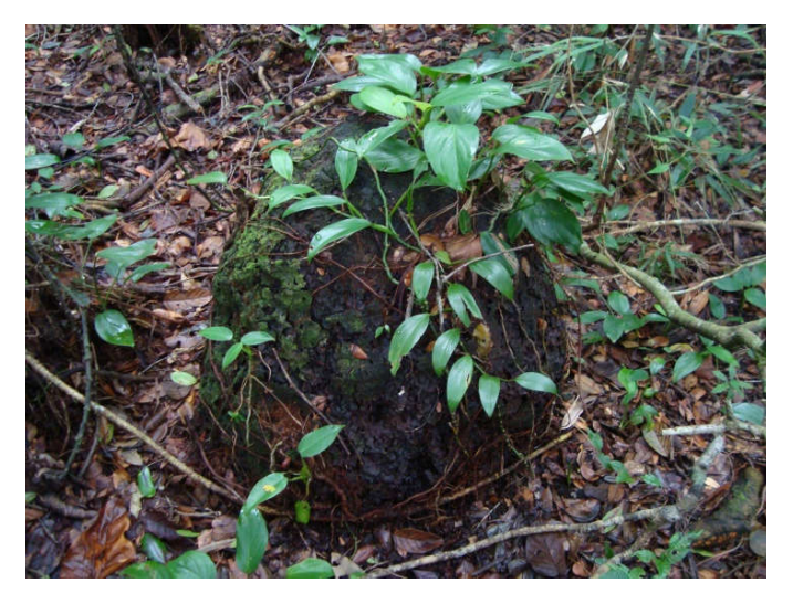
Figure 8. Nest of Nasutitermes ehrhardti in the forest of resting

Nasutitermes itapocuensis - It was the most frequent species present in both urban and natural areas. In an urbanized area near the preserved restinga, it was obtained a sample of individuals that had attacked the wooden plinth inside one house and another one of individuals that had attacked the wood handle of tools stored in a house. In the arboreal restinga, it was the most common species in fallen logs in the interior and in the edges of the forest. A dead trunk lying on the bank of the restinga , sheltering a large population of this termite, species, was very degraded and fragile, highlighting the ecological importance of the species in the decomposition of wood and its re-incorporation in the dynamic of environmental organic cycling. In the forest it was no possible to see nests of this termite species, only tunnels in trunks and specimens inside or underneath them. No endogenous nest was found.