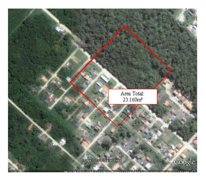
Figure 1. Aerial photo of the study area

The study region is located at the coordinates 26°12 '35.25' 'S 48°31' 49.46 W (Figure 1), in the district of Ubatuba, municipality of São Francisco do Sul (SFS), SC, located on an island of the northern coast of SC. The study was carried out in a portion of a natural restinga area on the beach of Ubatuba, located 12 kilometers from the center of SFS, between the beaches of Enseada and Itaguaçu, as well as in a portion of the urbanized area of the region. Encounters of specimens outside the delimited area were also considered. The restinga area is about 500 meters from the beach.