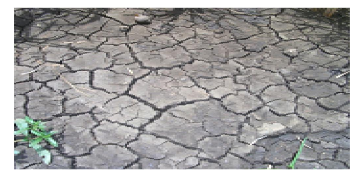
Figure 11. Typical examples of Vertisols in Fadama of Kebbi State.

Vertisols: Vertisols occur primarily in fadama areas of Kebbi State. They are characterised by high clay mineral content and