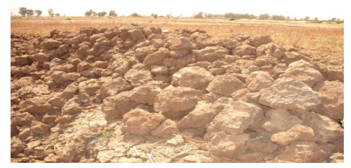
Figure 6. Typical example of Entisols in Fadama of Kebbi State. (Photograph: Suleiman Usman, 2011)

Entisols: These are new surface soils environment in few areas of Kebbi State's fadama. They are alluvial deposited particles of largely clay. The parent materials are commonly originated from old consolidated metamorphic rocks under floodplains condition (e.g. Figure 6).