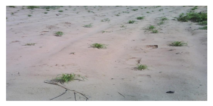
Figure 4. Typical example of Aridisols in Dryland of Kebbi State.

colluvial sand and sand-loam particles formed 100 to 10000 years ago (Holocene natural). The soil texture is fine sand, coarse sand, loamy coarse sand, loamy-sand, loam and silt loam. Single-grains and massive-sand are two common soil structures; these two types of soil structure, have different surface coloured that ranged from light, reddish and brownish.