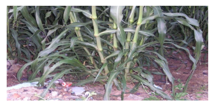
Figure 2. Typical example of Alfisols in Dryland of Kebbi State.

Alfisols: Alfisosls are found only in few areas of dryland and fadama of Kebbi State. They are soils of high humus due to accumulation of organic matter on the top surface soils. The surface colour is darker, texture is loamy-sand/clay and structure is granular with high decomposed organic materials (e.g. Figure 2). The surface climate condition is ustic (implying dryness) during the rainy season and aridic (dry-hot) in dry season; topography is levelled to gently slope; and parent materials are colluvials deposited particles of different organic materials which are mixed with sands, thoroughly.