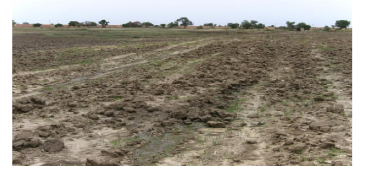
Figure 8. Typical example of Inceptisols in Fadama of Kebbi State.

Inceptisols: These are among the major fadama surface soils of Kebbi State after Vertisols. The properties of Inceptisols are characterised as ustic-cool to warm surface climate condition, flat to levelled topography, alluvial consolidated metamorphic parent materials, and are very well-drain surface condition (e.g. Figure 8). The soil texture is clay-loam, soil structure is plate-like, consistency is sticky and plastic, and colour is light-black to greyish.