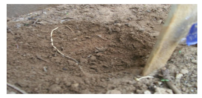
Figure 7. Typical example of Histosols in Dryland of Kebbi State.

Histosols: Histosols are few surface soils of dryland areas in Kebbi State. They have similar climate, topography, parent materials and physical properties with Aridisols. However, physically, the organic matter content of Histosols is high than that of Aridisols but lower compare with Alfisols. The surface thickness of organic materials is one of the most important characteristic used to assess Histosols in the State. As typically measured in the field, the thickness of organic matter is between 55 cm to 72 cm in the upper surface soil layer (e.g. Figure 7). Also, when water was added in a sample collected from the field, the soil remained saturated for up to 27 minutes and up to 1 day 2 hrs after heavy rains in July (25-26/7/2008) in dryland site of Argungu.