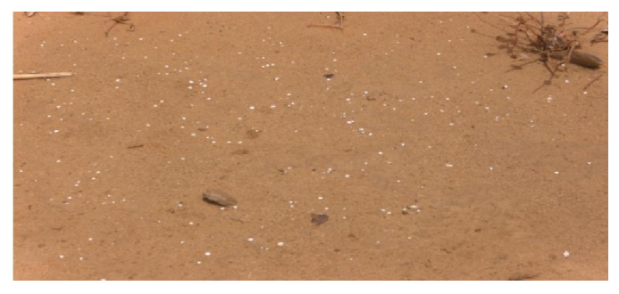
Figure 3. Typical example of Anthrosols in Dryland of Kebbi State.

Anthrosols: Anthrosols are very recent modified surface soils of dryland areas of Kebbi State. They are mineral soils which have occurred as a result of regular applications of inorganic mineral fertilizers (e.g. Figure 3). They are very-well drained with poor surface structure that is largely grains. Surface climate is torric (hot-dry) with very poor vegetation cover and flat to gently surface topography. Parent materials are week originated from consolidated soil particles with very low organic matter, fine-grained textured and very loose surface consistency.