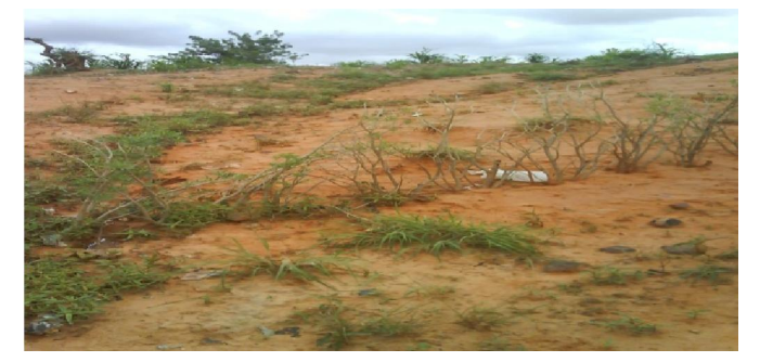
Figure 10. Typical example of Oxisols in Dryland of Kebbi State.

Oxisols: Oxisols are dominant soils of mostly gently slopes areas of dryland in Kebbi State. They have very low organic matter and poor surface soil condition. The surface climate and moisture are aridics with coarser sandy and sandy-loam textural classes of fluvial and lacustrine metamorphic parent materials. Oxisols have massive soil structure, which are brownish, reddish in coloured and are used for building and road side constructions in the State (e.g. Figure 10). Sheet and rill erosions are common in most of the Oxisols sites assessed.